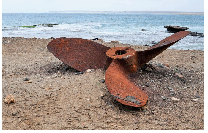
Chloride ions attack passive films on metal surfaces and cause corrosion.

Proc. Natl. Acad. Sci. U.S.A. 115, 7735 (2018).