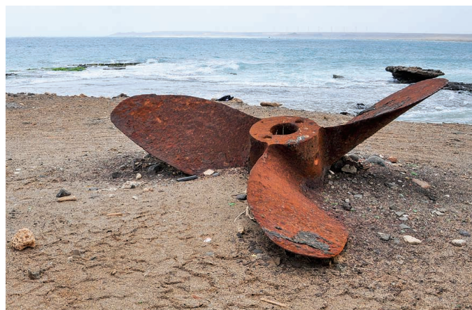
Chloride ions attack passive films on metal surfaces and cause corrosion.

Proc. Natl. Acad. Sci. U.S.A. 115 , 7735 (2018).